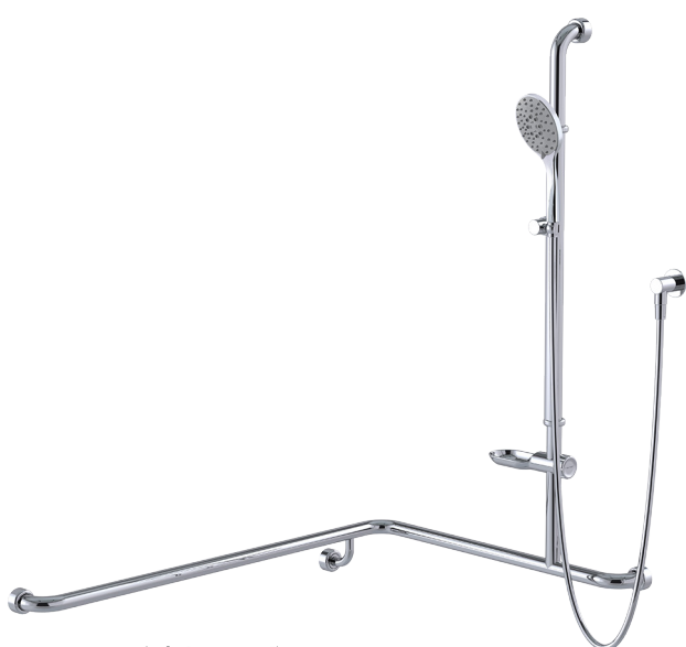
Drawn RH (Right Hand)